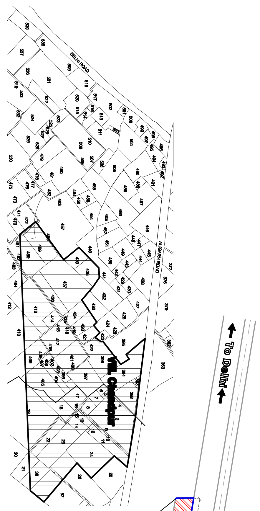
Location in Sazara Plan (Ganga Nagar)